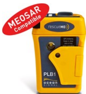
PLB1, the World's smallest PLB