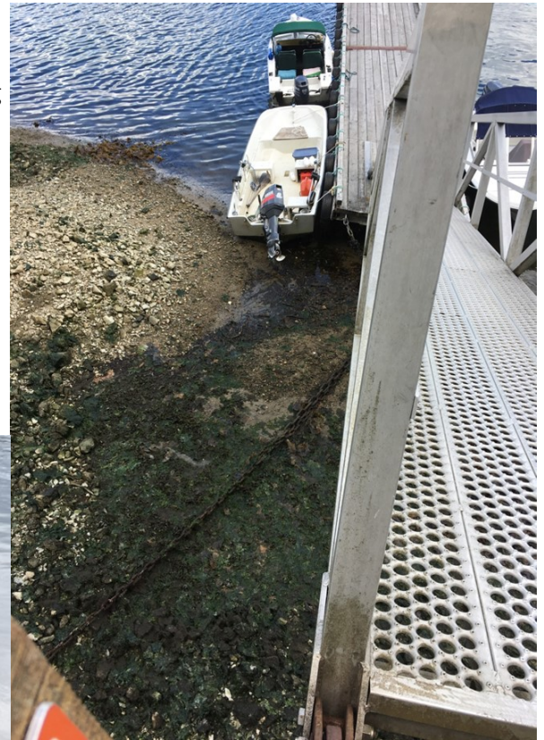
June 4, 2019, medium-low tide.