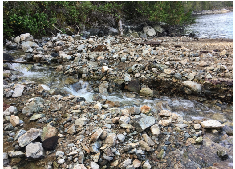
At the base of the cement ribbons, September 25, 2018.

As sediment built up under the dock, the dock started going dry on the NW corner at most low tides, effectively reducing the dock space available, and putting stress on the ramp and dock.